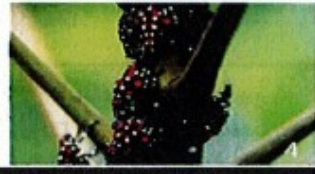
Spotted Lanternfly nymphs, present in spring and summer months. (Images from Park et al. 2009)