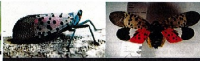
Adult Spotted Lanternfly, present in autumn months.

If you find any of these life stages of the spotted Lanternfly, remove, devitalize, and place in a sealed bag and dispose of bag in the garbage.