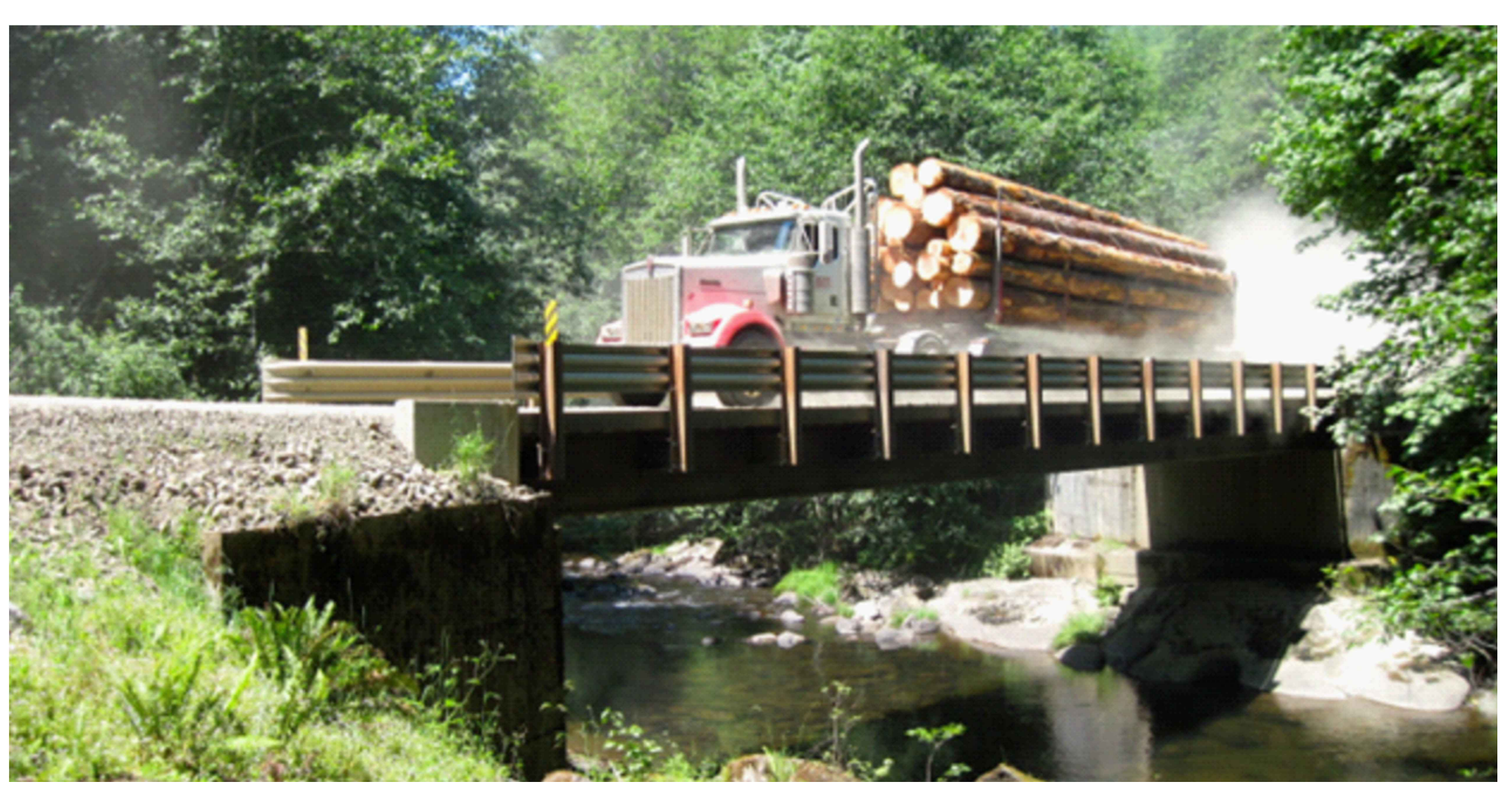
EXAMPLES OF PROPOSED BRIDGE TYPE