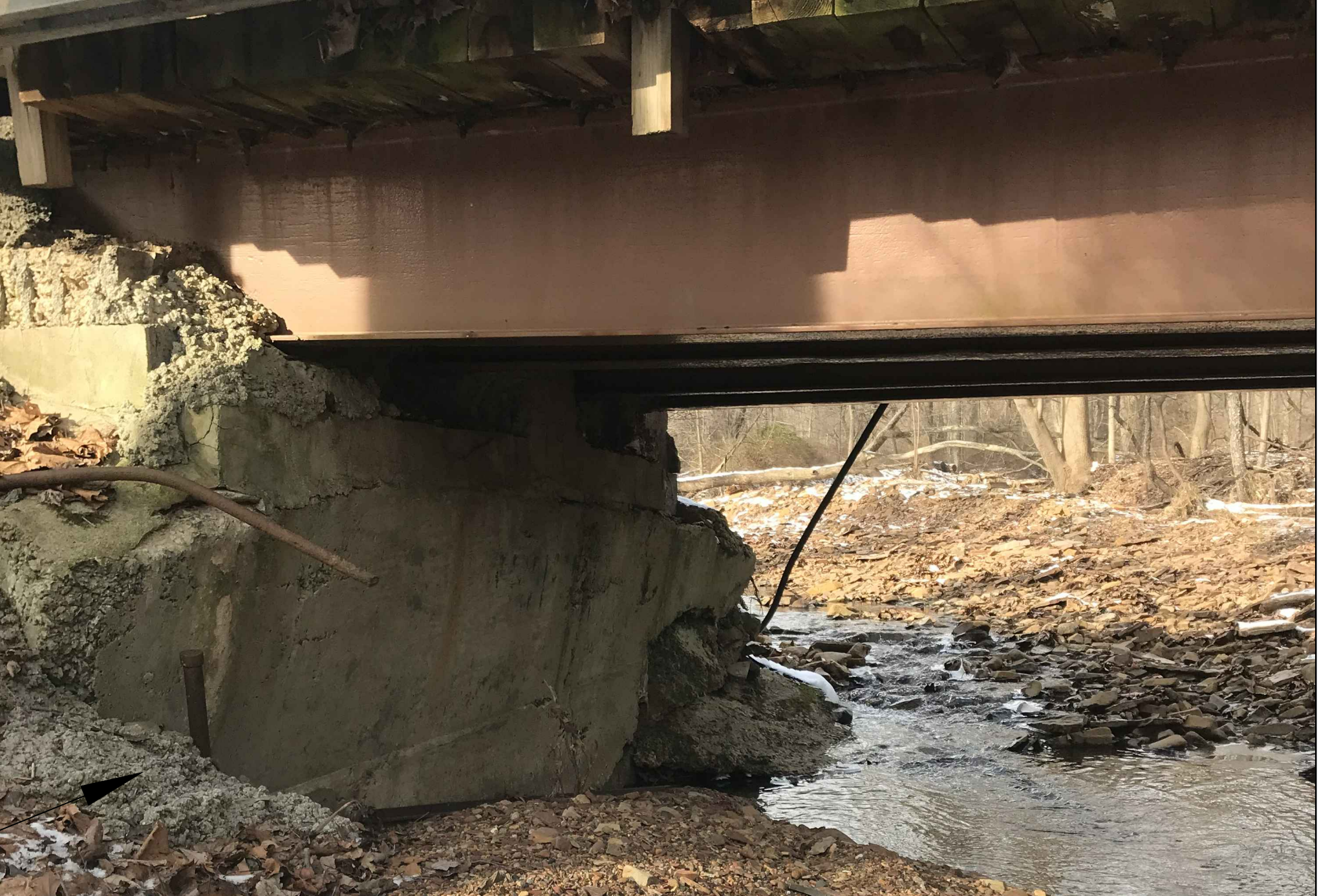
TYPICAL PREVIOUS STABILIZATION MEASURES