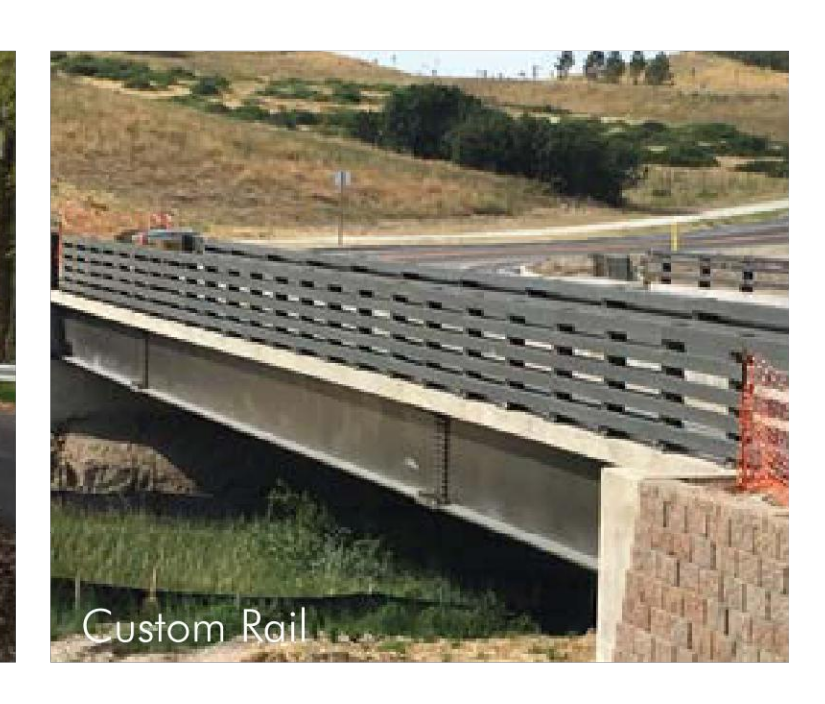
TL-1, TL-2, and TL 3 available upon request that will be deck mounted and a DOT railing.