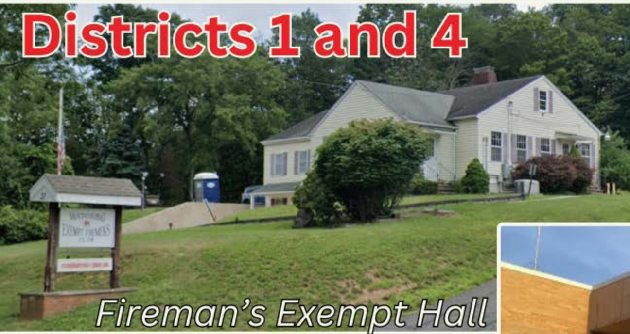
Fireman's Exempt Hall