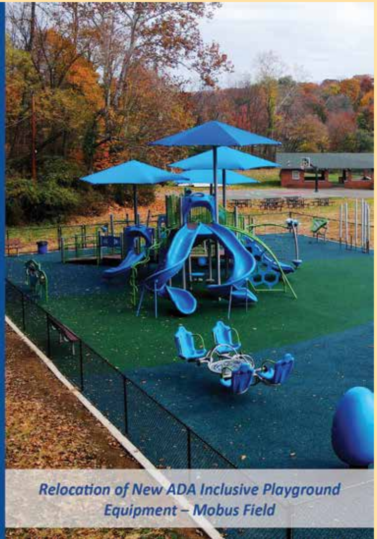
Relocation of New ADA Inclusive Playground Equipment – Mobus Field